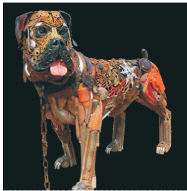
Medium: Metal Junk (found metal objects) by 'Dotun Popoola