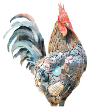
Medium: Metal Junks. Title: 'Akuko gagara' by 'Dotun Popoola